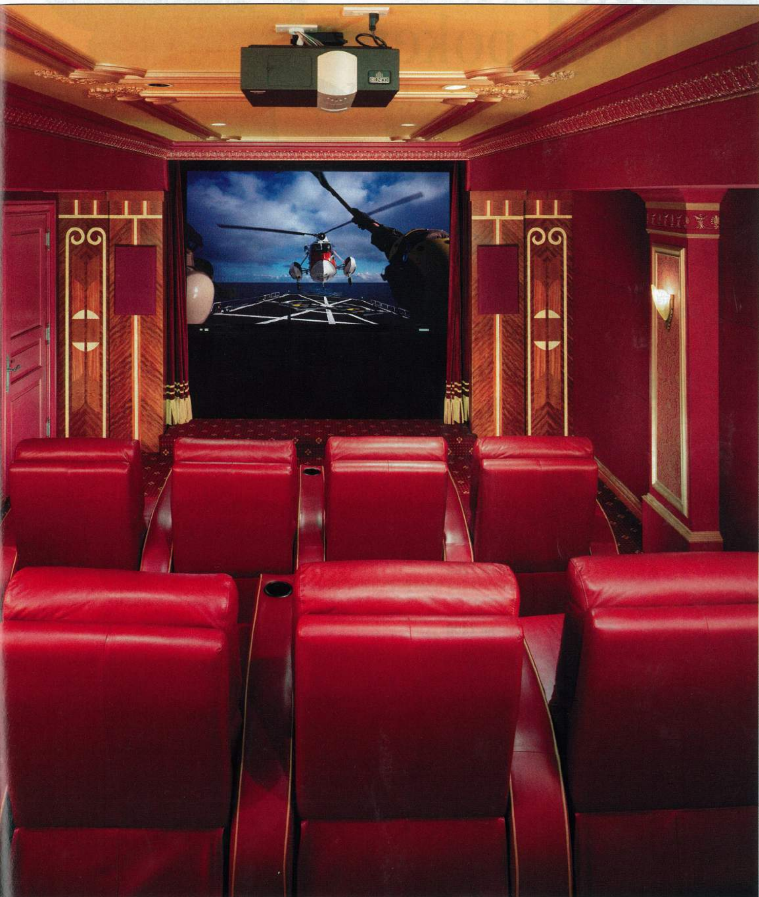
INSTALLATION BY ELECTRONICS DESIGN GROUP OF PISCATAWAY, NJ.